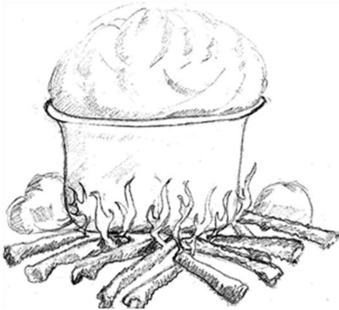
Illustration 2. Cooking food that is sitting on the ground

The missing cooking stone symbolises the missing development pillar 1 for your society. The absence of this development pillar makes it impossible to move your country out of poverty and underdevelopment, in the same way the missing cooking stone makes it impossible to cook food and it gets ready (Illustration 2). Just as food cooked this way ends up feeding a handful of people, the economic growth registered in the absence of the third development pillar ends up benefiting a handful few in the country. Put differently, the failure of your country to get out of poverty and underdevelopment is a natural response that will happen regardless of who the leader is, in the same way cooking food and it fails to get ready, because it is sitting on the ground, is a natural response that will happen regardless who the cook is. As long as non-conformity to the natural law out of underdevelopment holds true, chances of your country getting out of poverty and underdevelopment will remain non-existent, regardless of what your policy makers say, as the next three paragraphs testify; and thus, creating a bleak future for your children and grandchildren.